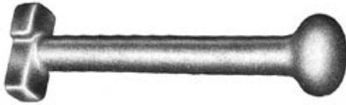
Grounding Stud, Aluminum Tube Temporary Ground