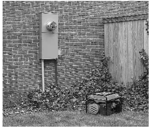
The SO2040M200S has provisions to accept our Standby Generator Kit, which provides easy switching between the main breaker and the generator-fed breaker.

Square D CSED products meet more applications and local code requirements than any other brand – demonstrating once again that no one does more with electricity .