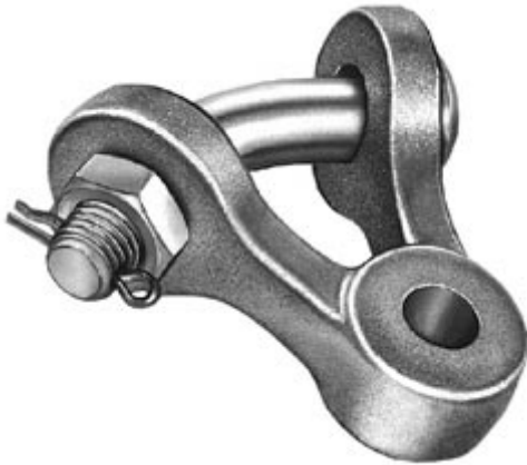
Y-Clevis Eye, Rotated, Ductile Iron, 0.750" Curved Bolt, Eye: 2.000" with 0.688" Hole, UTS 30,000 lb