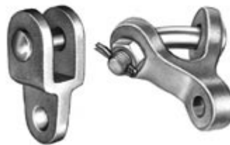
Clevis Eye & Y-Clevis Eye Coupling Fittings