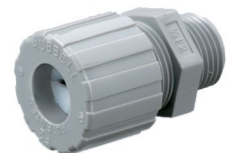
Gray Nylon Cord Connector